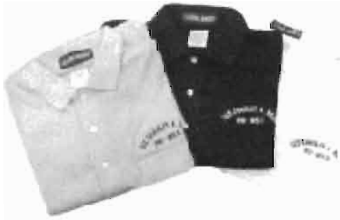
Item #1 Embroidered Golf Type shirts (with pocket)

Blue/Gold Lettering White/Blue Lettering Tan/Brown Lettering