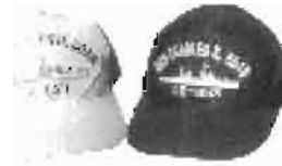
Item #6 Ball Cap White hat with grey ship and gold lettering or Blue hat with gold ship and lettering with either Before 1961 silhouette or After 1961 silhouette both $15.00

(please indicate hat color and silhouette preference)