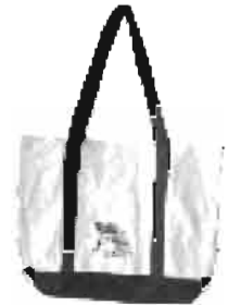
Item #3 Tote Bag Royal Blue/Ash Ships Logo Pocket 14X17X5 $12.00

(please indicate hat color and silhouette preference)